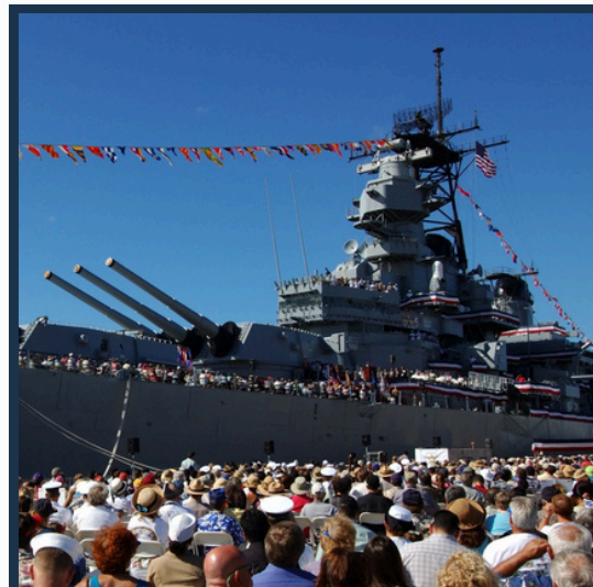
End of WWII Commemoration Ceremony September 2, 2025