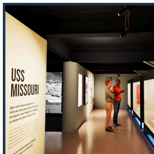
New WWII Exhibit Grand Opening September 2, 2025