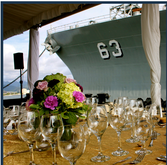
Commemoration Gala: An Evening of Honor August 31, 2025

Commemoration Gala sponsorship opportunities include purchasing tables at our special evening of honor, with proceeds directly supporting the 80 th commemoration events honoring our World War II veterans and the ongoing preservation of America's last battleship. Your support helps us honor the past and inspire the future.