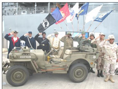
Living History Day reenactors

History came alive at the Battleship Missouri during its annual Living History Day on January 28. The celebration commemorated the 73rd anniversary of the USS Missouri’s original launch into service in 1944 and the 18th anniversary of its location in Pearl Harbor. It was a celebration and exhibition of historical organizations, cultural museums, and active duty commands.