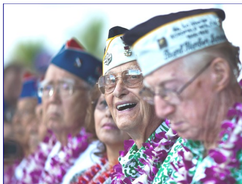
Pearl Harbor Survivors honored on December 7, 2016.

Peace came to the world on September 2, 1945 as the Japanese surrendered aboard the Battleship Missouri in Tokyo Bay. Today the USS Missouri is an historic reminder of our nation’s resolve and stands as a tribute to the brave men and women who gave the ultimate sacrifice in service to their country.