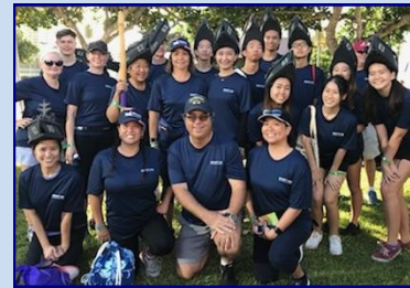
USS Missouri Charity Walk participants

On Sat., May 19, 2018, twenty three representatives of the Battleship Missouri joined an estimated 7,000 participants in the 40th annual Hawaii Lodging and Tourism Association's 5.25 mile Charity Walk in Honolulu.