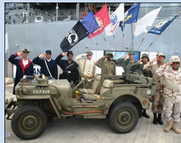
Living History Day reenactors

January, 2019 marks two significant anniversaries for the USS Missouri. The first is the 75th anniversary of the launching of the USS Missouri on January 29, 1944. The second is the twentieth anniversary of the USS Missouri Memorial’s opening to the public. These events will be commemorated on Saturday, January 26, 2019 as part of our Living History Day celebration.